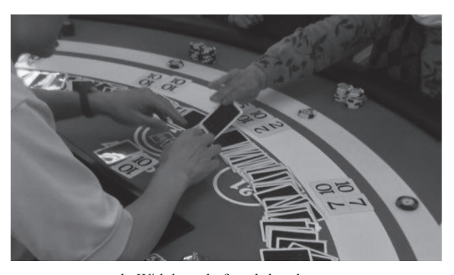
b: Withdrawal of cards by players

Heartbeat R-R intervals of I_k were plotted on the horizontal axis and those of I_k + 1 were plotted on the vertical axis, and the plots are distributed in an oval pattern with straight line I_k = I_k + 1 as a longitudinal axis. The major axis component L (horizontal to the line I_k = I_k + 1 ) and minor axis component (vertical to the line I_k = I_k + 1 ) were calculated, and the L/T ratio was regarded as the CSI value and the area value of L and T, log (L × T), was regarded as the CSI value indicate promotion and suppression of sympathetic nerve activity, respectively. An increase and decrease in the CVI value indicate promotion and suppression of parasympathetic nerve activity, respectively.