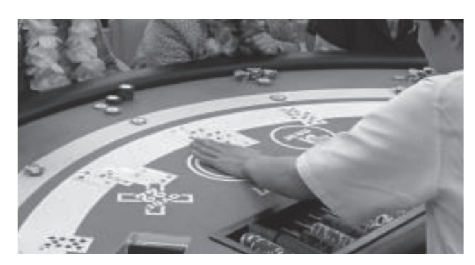
a: Distribution of cards by the dealer